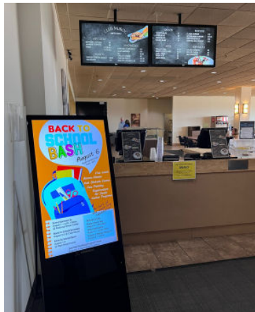
Club Muroc Dining Room